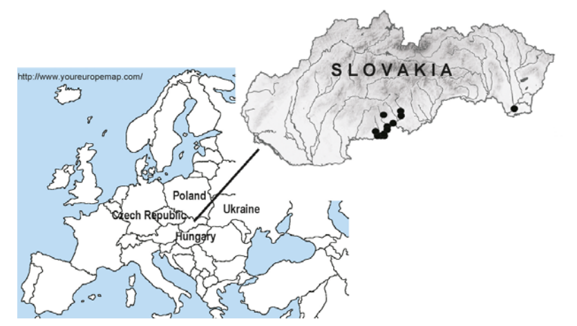
Fig. 1 Distribution map of Eleocharito palustris-Alismatetum lanceolati in Slovakia.

The nomenclature of plant species follows the checklist by Marhold and Hindák [25], except for the species Bolboschoenus laticarpus Marhold & al., Eryngium pusillum L., Juncus fontanesii J. Gay ex Laharpe and Lythrum junceum Banks & Sol. Names of aggregate taxa were used only in cases where the species could not be reliably determined. The names of plant communities were unified according to the Czech vegetation checklists [7,26], with the exception of Eleocharito palustris-Alismatetum lanceolati Minissale & Spampinato 1985. A nomenclatural aspect of this association is extensively discussed in this study, following the rules of the International Code of Phytosociological Nomenclature (ICPN) [27]. In accordance with the Czech wetland vegetation checklist [7], we use following forms of the names for two of the classes mentioned in the text: Phragmito-Magno-Caricetea and Isoëto-Nano-Juncetea, i.e., with the separation of the prefixes "Magno" and "Nano" by a hyphen. The ICPN [27] enables the use of ecological and morphological prefixes before 1979 (see ICPN art. 12); however, the rule for the particular form (either with or without separation by a hyphen) is lacking. Therefore, to clarify the concept of the names with prefixes, Dengler et al. [28] recommended the separation by the hyphen.